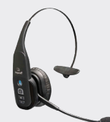
■ 94ACC0127 Bluetooth Headset VXI B350-XT